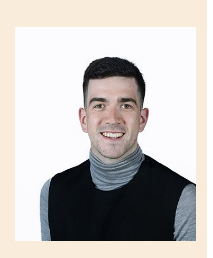
Senator Fintan Warfield Sinn Féin