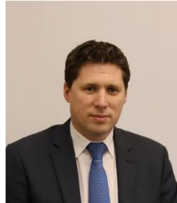
Matt Carthy T.D. Sinn Féin