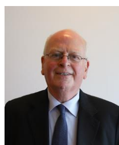
Senator Michael McDowell Independent