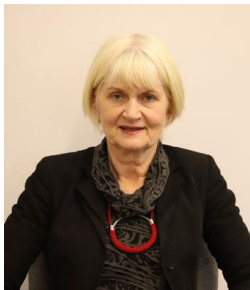
Marian Harkin T.D. Independent