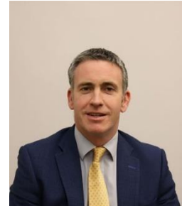
Damien English T.D. Fine Gael