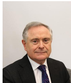
Brendan Howlin T.D. Labour Leas-Chathaoirleach