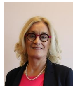
Senator Sharon Keogan Independent