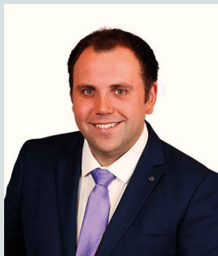
Cathal Crowe TD Fianna Fáil