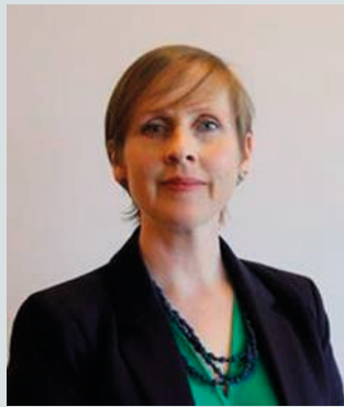
Senator Pauline O'Reilly Green Party