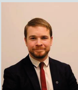
Donnchadh Ó Laoghaire TD Sinn Féin