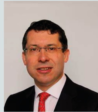
Senator Rónán Mullen Independent