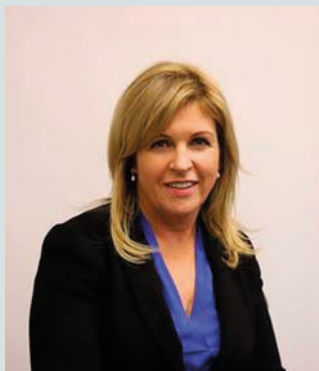
Rose Conway-Walsh TD Sinn Féin