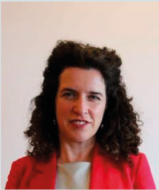
Senator Aisling Dolan Fine Gael