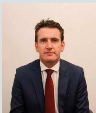
Aodhán Ó Ríordáin TD Labour Party