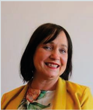
Senator Fiona O'Loughlin Fianna Fáil (Leas- Cathaoirleach)