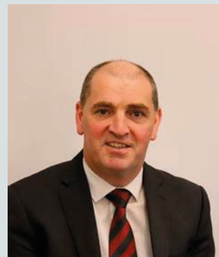
Paul Kehoe TD Fine Gael (Cathaoirleach)