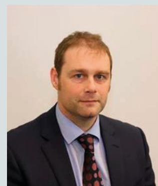
Marc Ó Cathasaigh TD Green Party