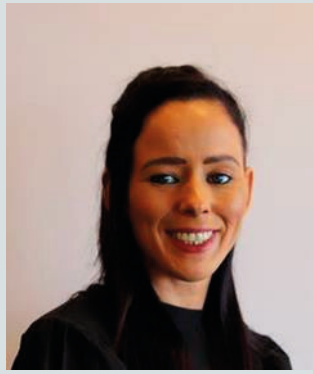
Senator Eileen Flynn Independent