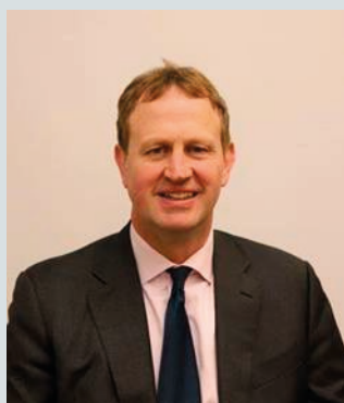
Jim O'Callaghan TD Fianna Fáil