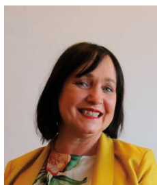
Senator Fiona O'Loughlin - FF