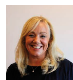
Senator Mary Seery Kearney - FG