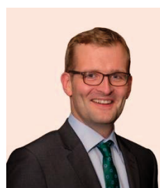
John Paul Phelan TD - FG