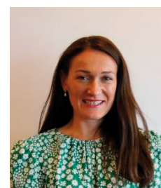
Senator Erin McGreehan - FF