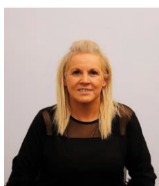
Jennifer Murnane O'Connor TD - FF