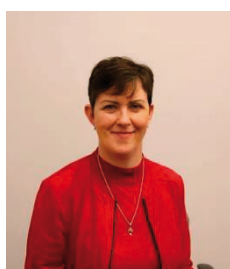
Pauline Tully TD (Vice-Chair) - SF