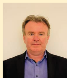
Senator Tom Clonan, Independent