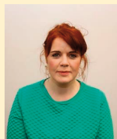
Neasa Hourigan T.D., Green Party