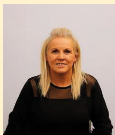
Jennifer Murnane O'Connor T.D., Fianna Fáil