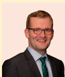
John Paul Phelan T.D., Fine Gael