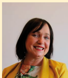
Senator Fiona O'Loughlin, Fianna Fáil