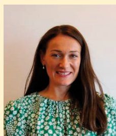
Senator Erin McGreehan Fianna Fáil