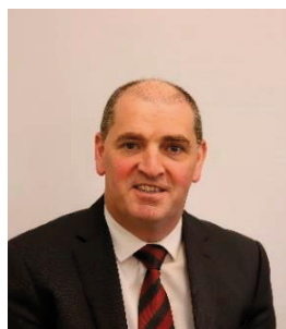
Paul Kehoe T.D. Fine Gael