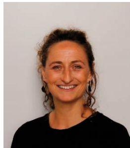
Sen. Lynn Boylan Sinn Féin