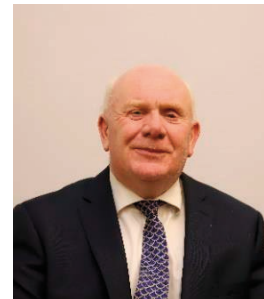
Jackie Cahill T.D. Fianna Fáil [Cathaoirleach]