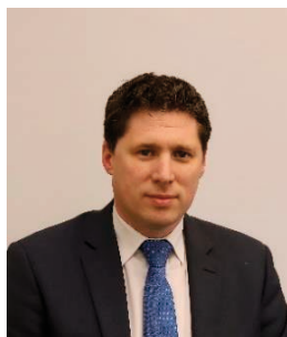
Matt Carthy T.D. Sinn Féin