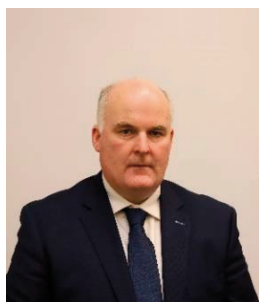
Joe Flaherty T.D. Fianna Fáil