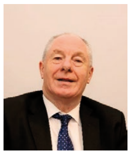
Michael Ring T.D. Fine Gael