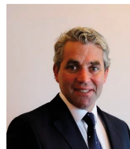
Sen. Tim Lombard Fine Gael [Leas- Chathaoirleach]