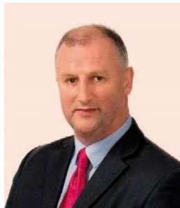
Sen. Victor Boyhan Independent

The following Deputies and Senators are members of the Joint Committee on Agriculture, Food and the Marine of the 33 rd Dáil Éireann and the 26 th Seanad Éireann.