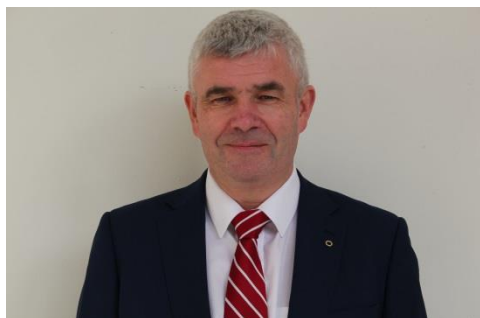
An Seanadóir Pádraig Ó Céidigh Cathaoirleach

Water is essential for public health and human life, the environment and the economy. While we are fortunate in Ireland to have an abundant supply of water in the environment, it is incumbent on us to use it in a manner that promotes conservation and that protects it from pollution.